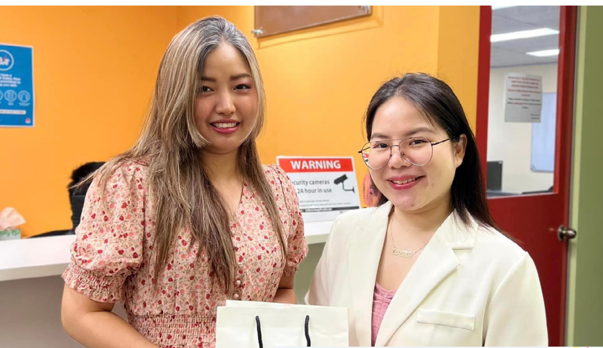
Competition Prize Winner 😊