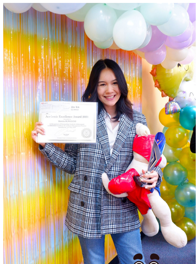
Academic Excellence Award 2021 🤪