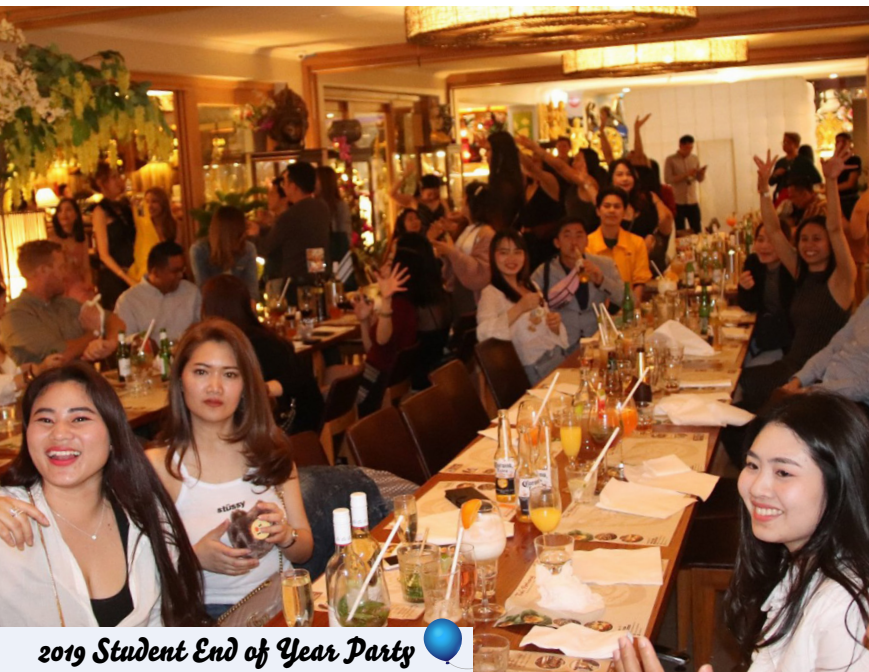
2019 Student End of Year Party 🎉