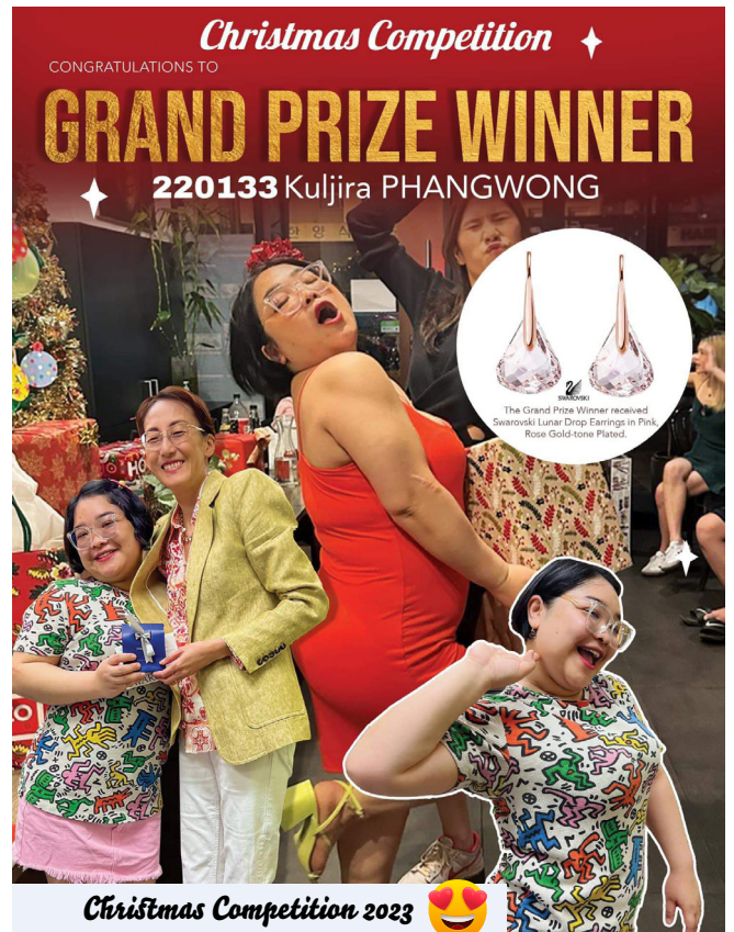
Christmas Competition 2023 🥰