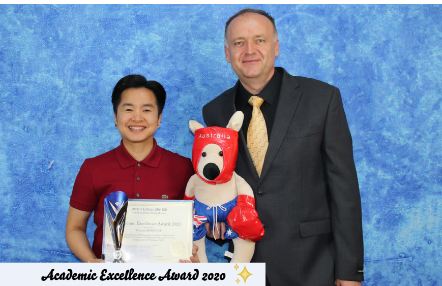
Academic Excellence Award 2020 ✨